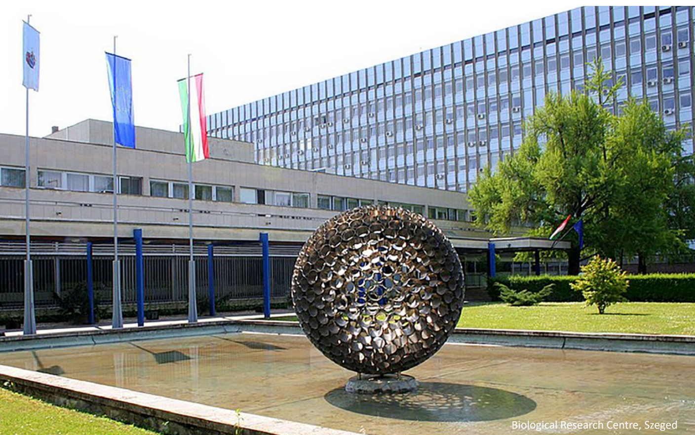
Biological Research Centre, Szeged